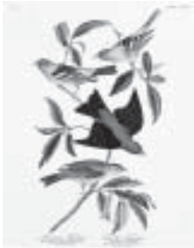
Audubon’s print of Louisiana (now called Western) Tanager (top 2 birds) and male and female Scarlet Tanagers.

The male Scarlet Tanager, Piranga olivacea is a stunning bird in spring and summer. The incandescent red feathers covering most of its body contrast sharply with the glossy black of its wings and tail. Although this bird is a fairly common species in deciduous forests in our region, many people have never seen one. This may be thought surprising given the “black-winged red bird’s bright colors, but its habit of staying in the forest canopy for most of the summer tends to conceal it from view. Females have olive-green plumage in place of the male’s red, making them still harder to see. But the males—did I mention