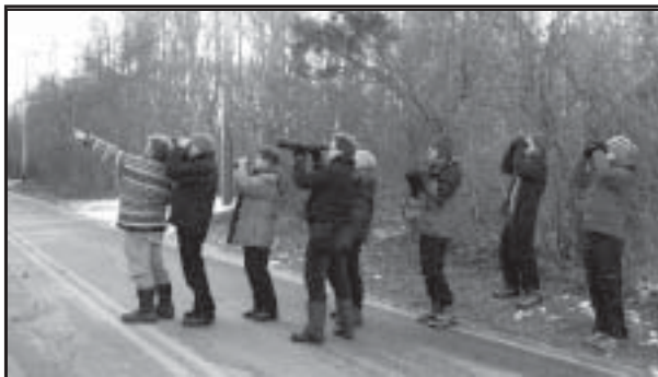
A Bohemian Waxwing with a flock of robins on the Wauwinet Road was a life bird for most in the group.